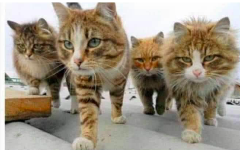
Coming Out Of The Prayer Room